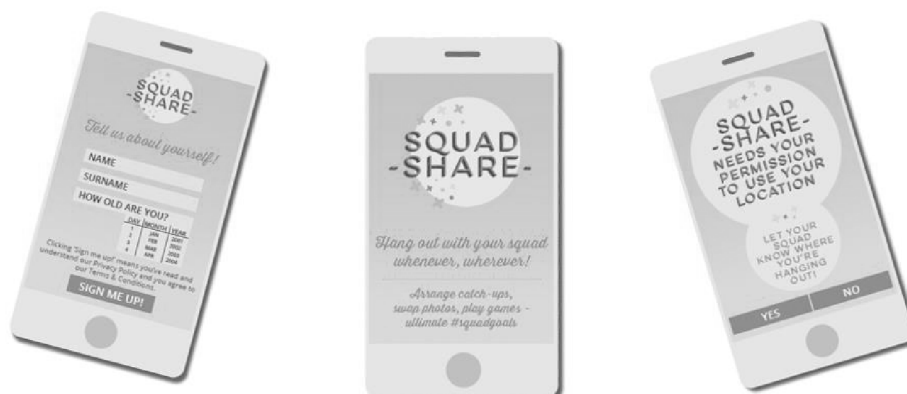
Image 2: Screenshots from our fictitious app “SquadShare”, created specially by the DPC