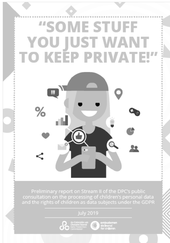
Image 3: “Some stuff you just want to keep private!” – Our preliminary report on the feedback and high-level trends from the DPC’s child-focused public consultation