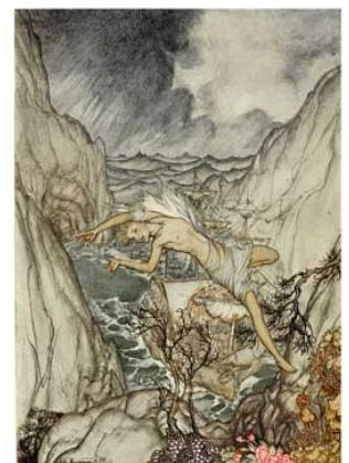
The Tempest. Illustrated by Arthur Rackham. Heinemann, 1926.

"The Secretariat has created a rudimentary 'Day in Privacy History' calendar"