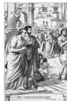
Internet Shakespeare Editions

"A timely global debate on the secret use of biometric applications including information about the risks is urgently required."