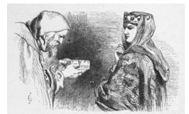
SHAKESPEARE: CYMBELINE. Cornelius, the physician, presenting a box of 'most poisonous compounds' to the Queen (Act I, Scene V) in William Shakespeare's 'Cymbeline.' Wood engraving, 1881, after Sir John Gilbert

"Save the date 17–20 October for the 38th Conference 2016, Marrakesh"