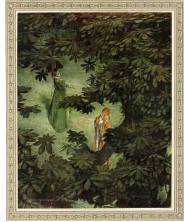
Twelfth Night. Illustrations by W. Heath Robinson. Hodder & Stoughton, 1918.

Email: ICDPPCEXCO@privacy.org.nz Follow us on twitter @ICDPPCEXCo