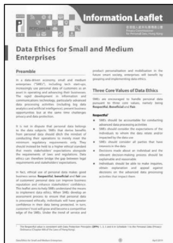
Leaflet: “Data Ethics for Small and Medium Enterprises”