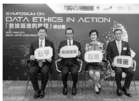
Symposium on "Data Ethics in Action"